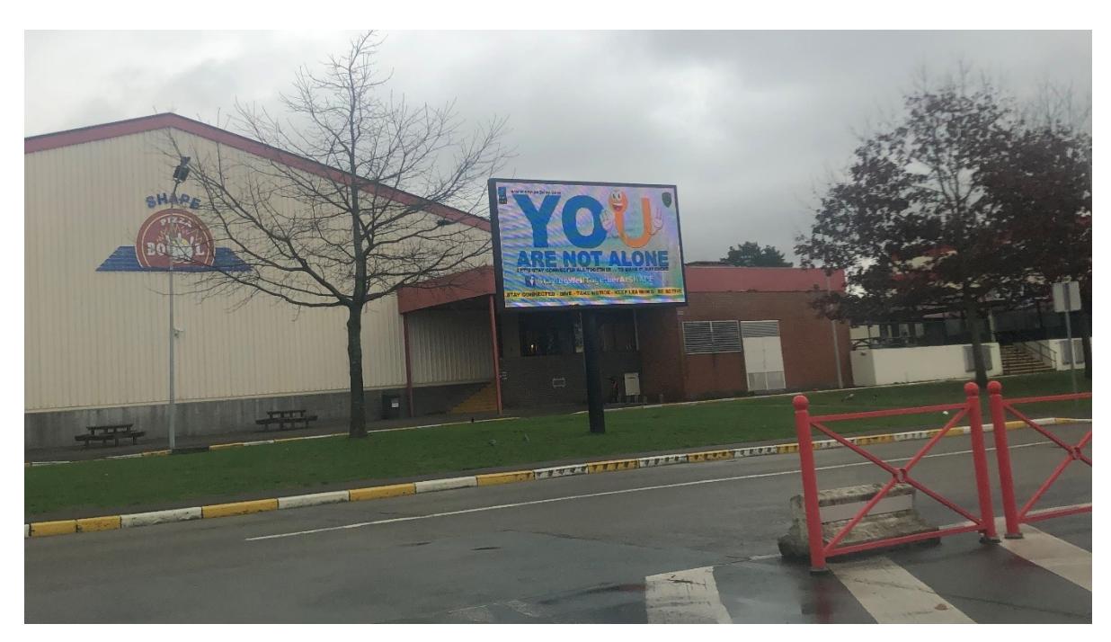
Figure 1 Banner display of Staying Well Together

We needed to identify the resources available in the community that could be mobilised to help meet the needs of the community. To do this we developed a team made up of international psychologists and psychiatrists. This was accomplished rapidly through word of mouth and social media announcements. Team members were keen to have an opportunity to use their skills in a timely and impactful way. Collectively we developed a series of principles and activities that engaged all nations throughout the community, and which responded sensitively to the unique circumstances that each nation faced.