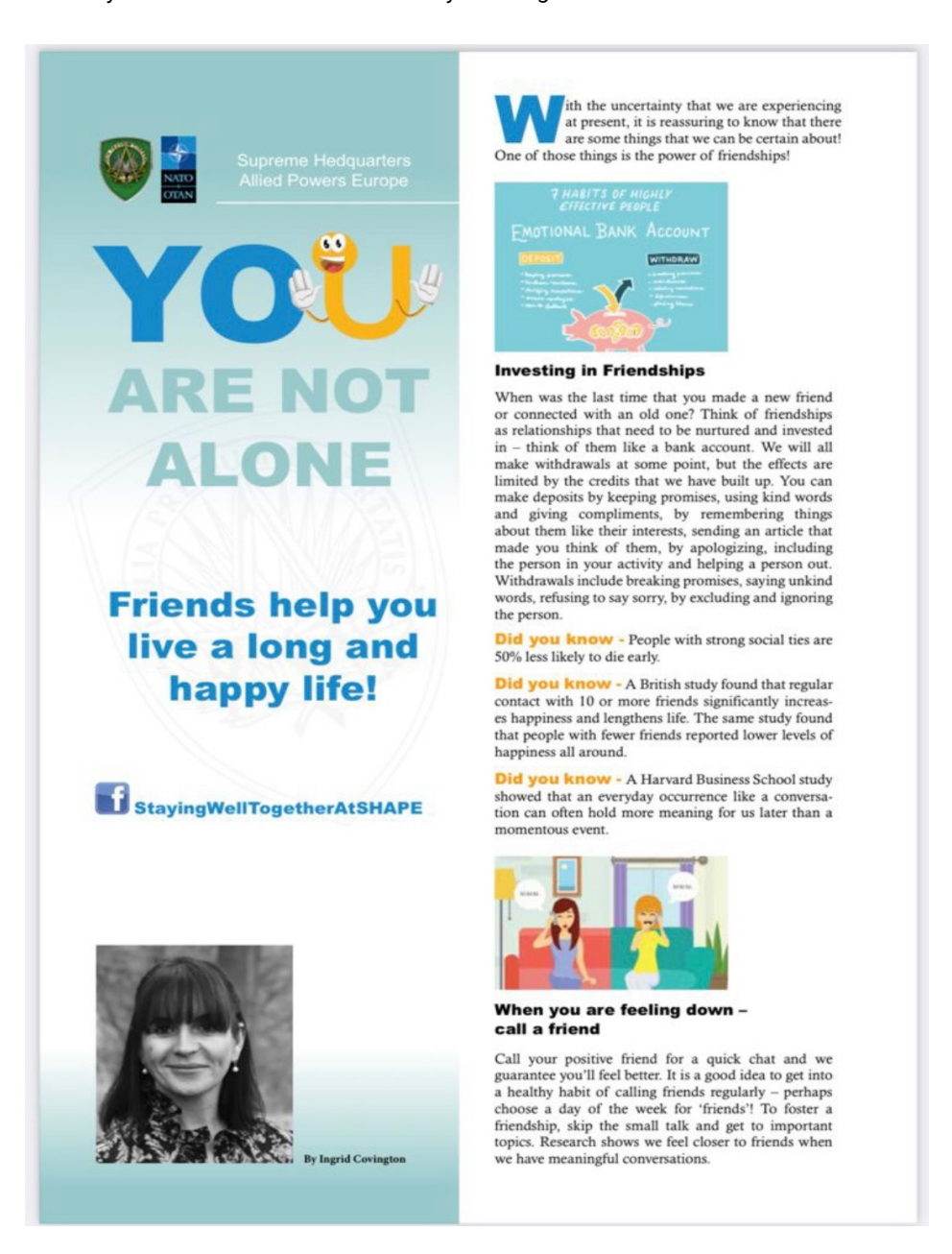
Figure 3 Example of a monthly column in the SHAPE Community Life Magazine

Over time, connections across the community were made and members of the community grew in strength and developed confidence in sharing articles and stories about resilience and mental health, demonstrating a level of trust and compassion that continues to grow. The primary goal of the campaign was to facilitate and create opportunities for individuals to make meaningful connections with other members of SHAPE. By strengthening the psychological safety and security of the community, we believed that the resilience of the SHAPE community was being strengthened.