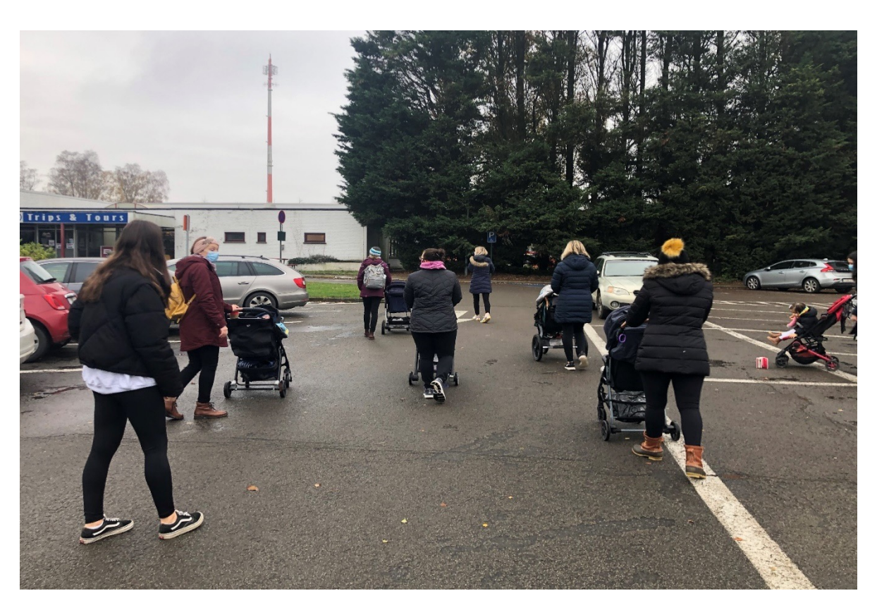
Figure 2 Walk and Talk programme

The Language Buddy Programme helped to increase skills and improve self-esteem by offering peer language support ( Keep Learning ); and the Walk and Talk programmes (designed for specific communities) encouraged people to keep active throughout the year, especially during winter, through a social walking programme designed to strengthen the link between exercise and reduced depression and anxiety ( Be Active ).