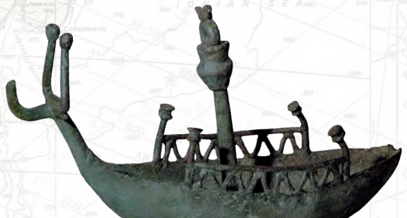
Nuragic boat - VII century B.C.

Born in Milan, she trained in Psychoanalytic Child Psychotherapy at the Tavistock Centre. She works in London an early years specialist therapist, and teaches psychoanalytic theory and infant observation at the Anna Freud Centre. She has worked in several Group Relation Conferences both in Italy and in the UK, as a member, translator and consultant.