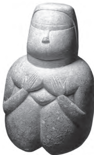
Mother Goddess. IV millennium B.C. - Archaeological Museum, Cagliari